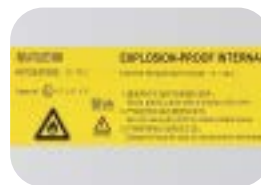
ATEX Certification Label