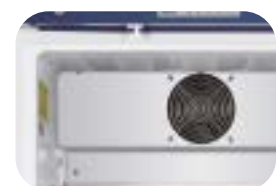
Explosion Proof Cabinet/Fan